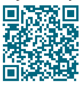
or visit bit.ly/3EOaTzj